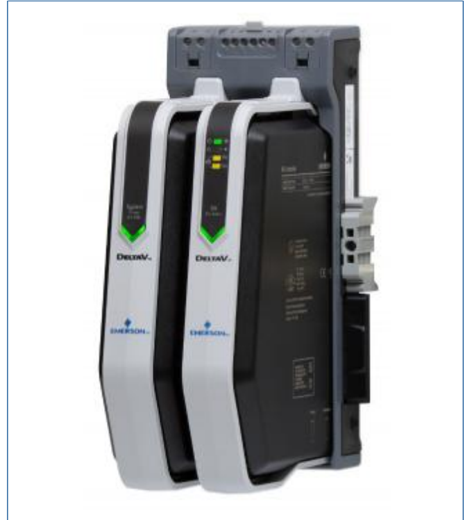
The SX Controller.

Field Proven Architecture. The SX Controller is an evolution of the DeltaV MX Controller. The new design delivers installation and robustness enhancement while still using the same processor and OS that has proven itself in the field. All IO cards run the latest software enhancements of corresponding M-series IO cards and deliver the same field proven, reliable operation.